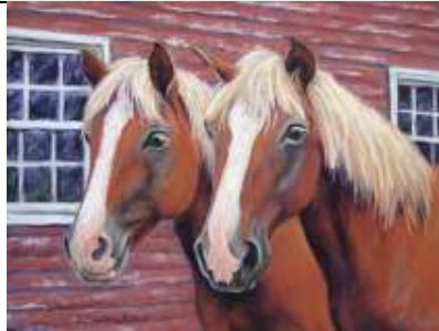
Gypsy & Ginger sold