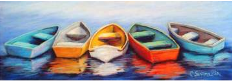
No Skippers' sold