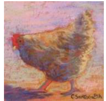
Cool Chick - 5x5"

Mustangs Painting at Ever After Mustang Rescue - www.mustangrescue.org