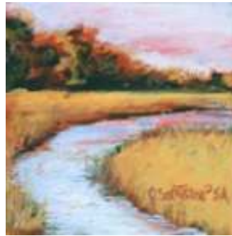
Autumn Marsh - 4x4"