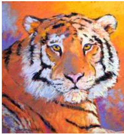
Amber Eyes 15"x14"