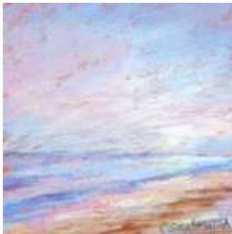
Beach - 4x4"