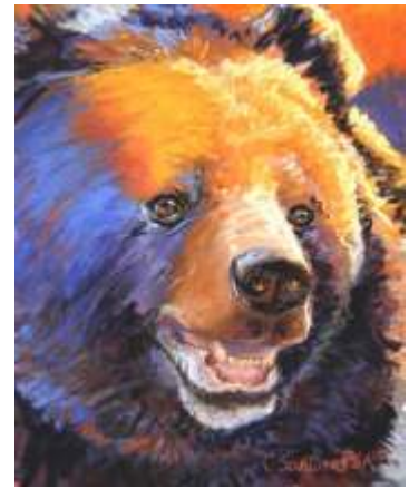
My Gentle Side 10"x8"