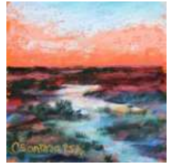
Sundown Marsh - 4x4"