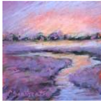
Purple Marsh - 4x4"