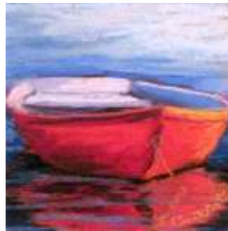
Red Boat - 4x4"