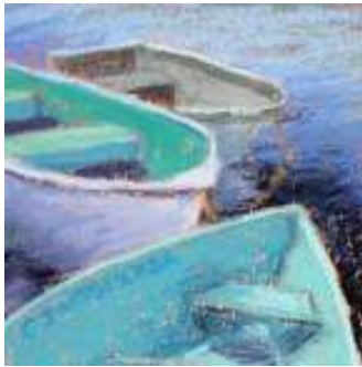
Three Boats - 4x4"