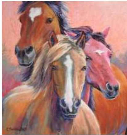
Untamed Spirits 21"x20"