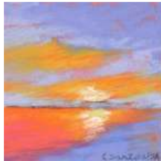
Orange Beach - 4x4"