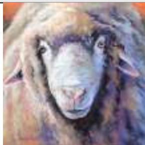
Ewe Lookin' for Me?