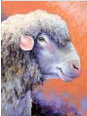
What's Up With Ewe?