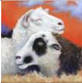
Ewe and I