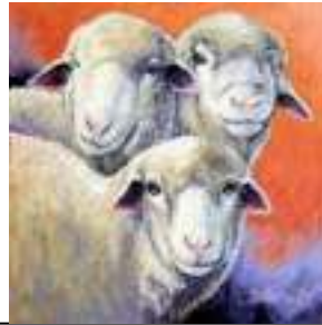
Ewe, Ewe and Ewe